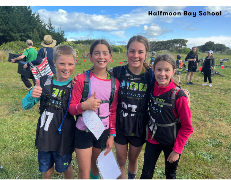
Halfmoon Bay School