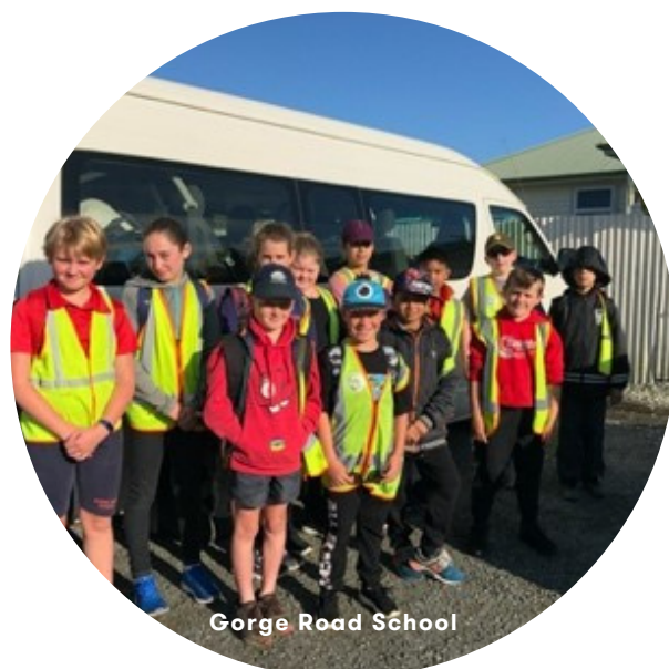
Gorge Road School